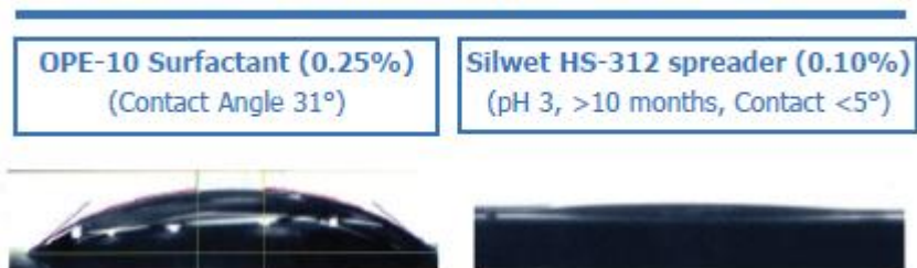
Figure 1: Contact Angles of Spreader Adjuvants

Because the Silwet HS-312 spreader has very low surface tension, the contact angle of spray solutions on leaf surfaces is reduced compared to other surfactant adjuvants. This important property is shown in Figure 1 below, which illustrates Silwet HS-312 spreader having less than 5° contact angle relative to the Octylphenol Ethoxylate containing 10 EO units (OPE-10), having a 31° contact angle. It is also important to note that the lower Silwet HS-312 spreader contact angle is achieved at much lower concentrations compared to the OPE-10 surfactant concentration.