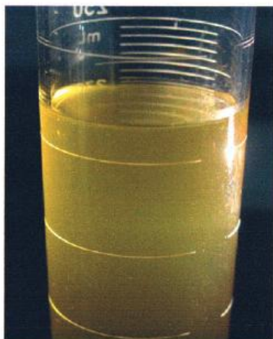
Figure 2: SAG 1572 silicone antifoam emulsion at 0.3% use level in a non-ionic spray adjuvant formulation.

1572 silicone antifoam emulsion remains homogeneously dispersed for greater than two months, while typical foam control agents show significant signs of separation after a few days.