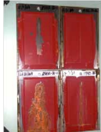
Standard / CoatOSil MP 200 silane

Note: Test results. Actual results may vary.