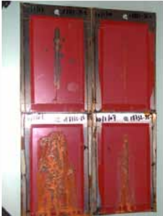
Standard / CoatOSil MP 200 silane