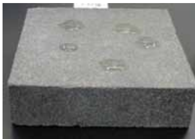
Figure 2: Slight Beading Effect of Silblock WMS Masonry Water Repellent Treated Concrete

The contact angle of distilled water droplets was measured on a treated concrete surface. Silblock WMS masonry water repellent showed a very slight beading effect on concrete – see Figure 2. If a more significant beading effect (or contact angle about 100 to 110 degree or higher) is desired, the addition of paraffin wax emulsion or fluorocarbon resin emulsion is required. In general, beading effects are not considered as a true measure of the efficacy of water repellency.