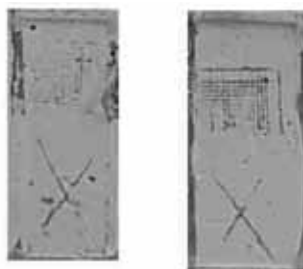
Figure 3: Paintability of Silblock WMS Masonry Water Repellent Treated Concrete (left – Control, right – Treated with Silblock WMS Masonry Water Repellent). Silblock WMS Masonry Water Repellent as Primer Showed Minimal Effects on Acrylic Paint Adhesion

Silblock WMS masonry water repellent-treated concrete specimens were painted with commercially available solvent-based acrylic paint. After one month at room temperature, the adhesion values of the paint were determined according to JIS K5600-5-6 – Testing Methods for paints – Part 5: Mechanical properties of film – Section 6: Adhesion test (Cross-cut test). Pursuant to this method – a lattice pattern and an X-cut was cut into the painted substrate. Then pressure sensitive tape was applied to the pattern, cut and then pulled off – subsequently checking for paint flakes. Silblock WMS masonry water repellent showed excellent paintability on concrete; Silblock WMS masonry water repellent had minimal effect on the adhesion of paint – few or no paint flakes from substrates were observed in cross cut tests – see Figure 3. Silblock WMS masonry water repellent may be considered for use as a water repellent primer. However, always apply on a test area to determine actual paintability.