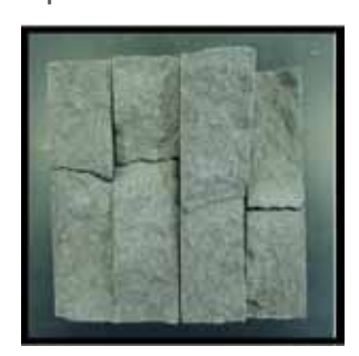
Figure 1: India Ink Penetration Depths with Silblock WMS Masonry Water Repellent (right) as Compared to Control (left)

Cement mortars treated with Silblock WMS masonry water repellent were cut in half. An aqueous solution of India ink was applied onto the cut mortars. Penetration depths were measured: The penetration depth is the average thickness of the non-wet band (or non-pigmented bands) of 10 measurements (excluding minimum and maximum measurements). Silblock WMS masonry water repellent showed a penetration depth of 4 mm - see Figure 1.