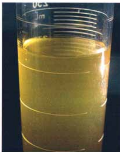
Figure 2: SAG 1572 silicone antifoam emulsion at 0.3% use level in a nonionic spray adjuvant formulation.

Effective dispersibility in agrochemical formulations is an issue with conventional foam control agents. However, the SAG 1572 silicone antifoam emulsion offers much improved compatibility with many adjuvants and "In-can" pesticide formulations. Figure 2 illustrates the dispersion stability of SAG 1572 silicone antifoam emulsion in a typical nonionic surfactant based adjuvant system. In this example, SAG 1572 silicone antifoam emulsion remains homogeneously dispersed for greater than two months, while typical foam control agents show significant signs of separation after a few days.