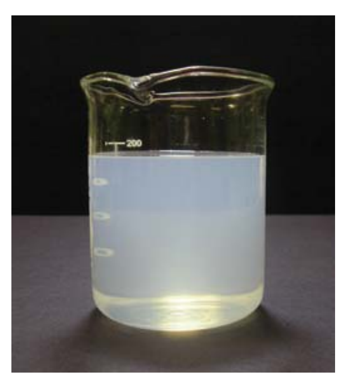
1% Magnasoft JSS hydrophilic textile enhancer water solution after boiling at 100°C, pH:12

(a) Biocides must be used in accordance with FIFRA regulations and manufacturer's label directions.