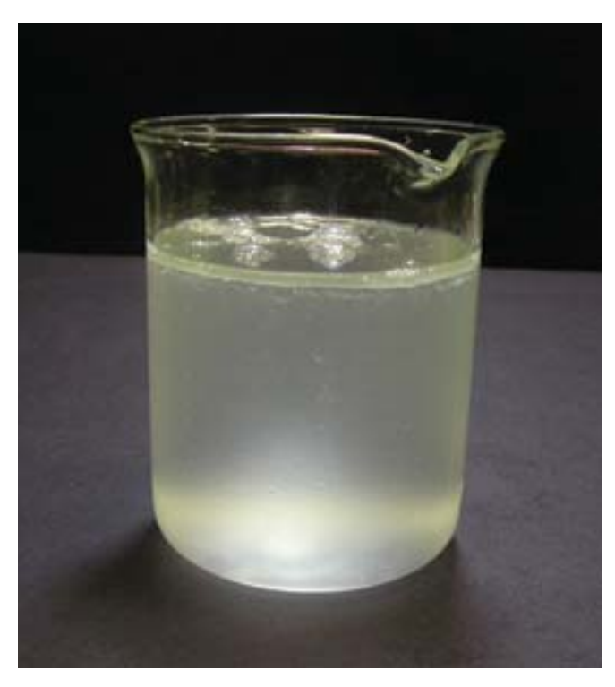
1% Conventional aminosilicone emulsion after boiling at 100°C, pH:12.